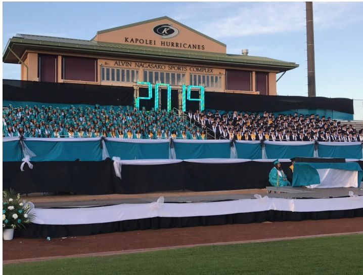
Congratulations to the 443 Kapolei High School seniors who received their diplomas! This year's commencement exercises were held on campus on May 24.