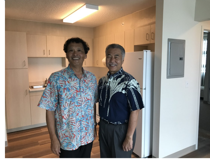
Councilmember Menor and Governor David Ige are pictured above in one of the apartments at Hale Kewalo, an affordable rental apartment building located in Kaka'ako. The grand opening and blessing were held on May 13.