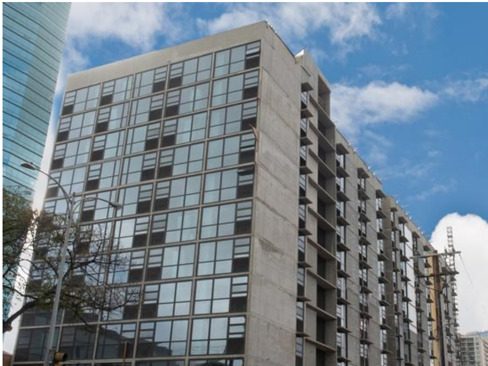
Pictured above is the newly completed Hale Kewalo apartment building which is located at 450 Piikoi Street. Hawaii Affordable Properties is now accepting applications for new tenants.

Hale Kewalo was developed and built by Stanford Carr Development and will be operated by Hawaii Affordable Properties. Both companies are locally owned and are committed to providing local residents with affordable rental options. If you are interested in applying for a unit, please visit www.halekewalo.com or call Hawaii Affordable Properties at 589-1845 ext. 14 to obtain an application.