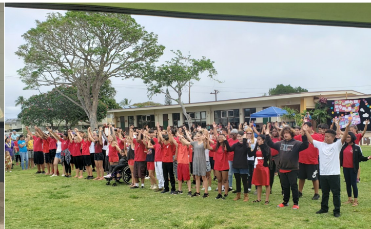
Iroquois Point students are pictured above performing as part of the school's Ohana Day which was held on campus on May 17.