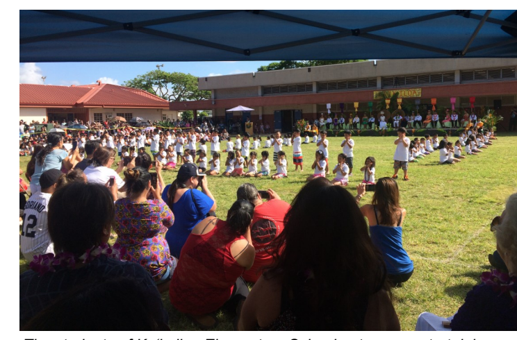
The students of Ka'imiloa Elementary School put on an entertaining program as part of the school's "Hawaii In Ewa Beach" May Day Celebration on May 12.